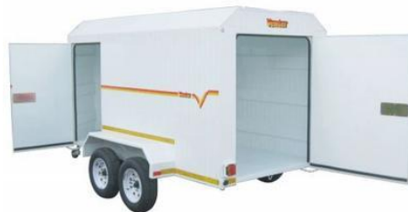
Back view open